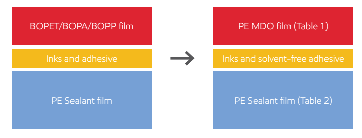
Table 2: PE Sealant film using performance PE polymers and recycled PE

Figure 2: Machine direction orientation (MDO) blown process to replace BOPET/BOPET/BOPP film to highly oriented PE film with outstanding gloss, haze and stiffness properties